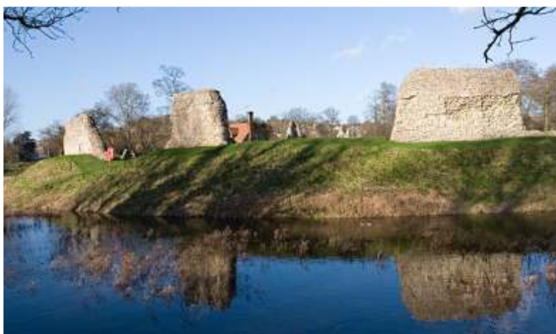
Berkhamsted Castle

During the reign of Henry VIII, the castle was given in turn to three of his queens, Katherine of Aragon, Anne Boleyn and Jane Seymour, but none of them ever lived there.