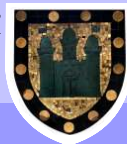
Berkhamsted town crest from 1859 fireplace in town hall