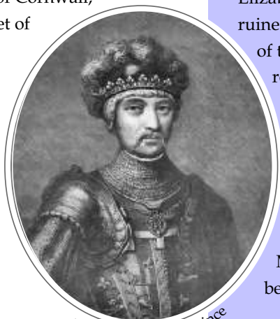
Edward, the Black Prince

The most recent royal visit to the castle was in June 1935, by the Prince of Wales (later Edward VIII) who met a large assembled gathering of ex-servicemen, Girl Guides and Boy Scouts, school children and other representatives of the community.