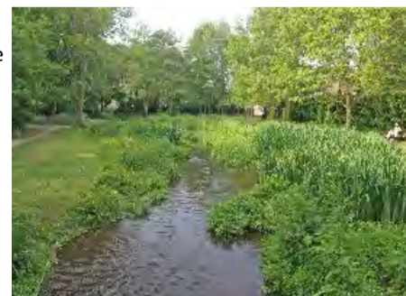
Meades Water Gardens