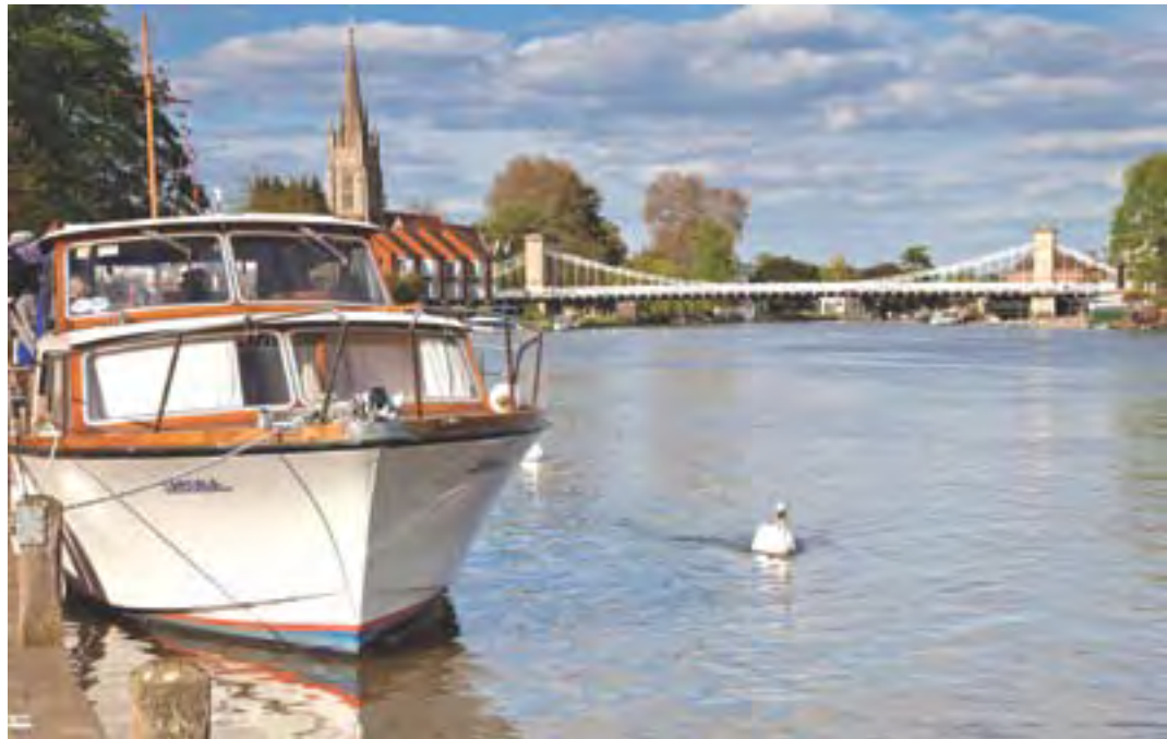
River Thames at Marlow