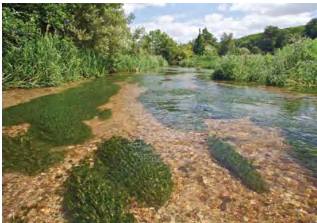
River Chess at Latimer (Allen Beechey)