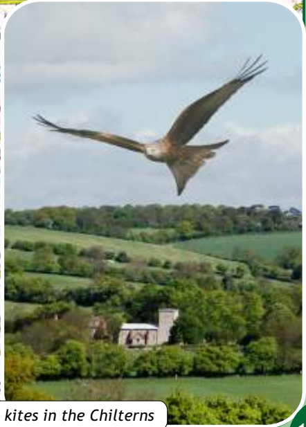
Red kites in the Chilterns