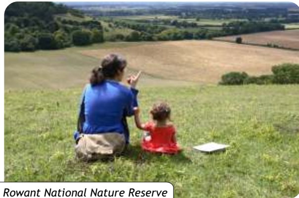
Aston Rowant National Nature Reserve

This is a beautiful chalk downland reserve managed by Natural England, with carpets of scented wildflowers in the summer and magnificent views. Follow the brown tourist sign to the car park where there is a bike rack so that you can leave your bike and explore on foot.