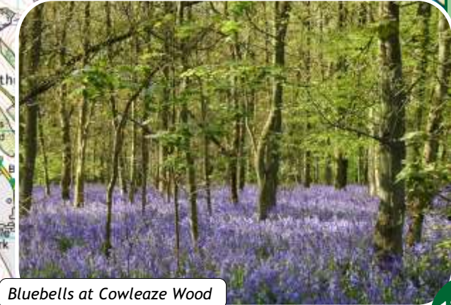
Bluebells at Cowleaze Wood