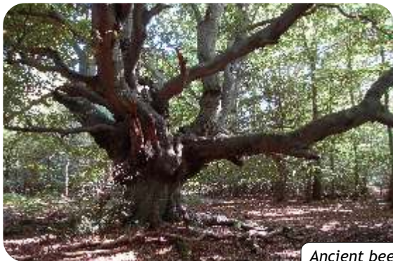
Ancient beech, Frithsden Beeches

4 Berkhamsted is a busy town with shops cafés and pubs. It has a history going back to at least 1066, when William the Conqueror was handed the crown of England here. You can still see the remains of the Norman Castle that was subsequently built in stone during the mid 12th century. The remains of the castle and the beautiful grounds can be visited free of charge.