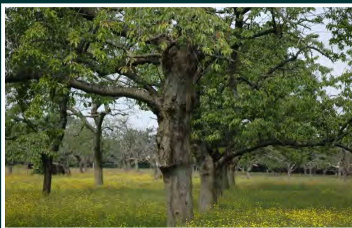
A traditional cherry orchard - most have been lost