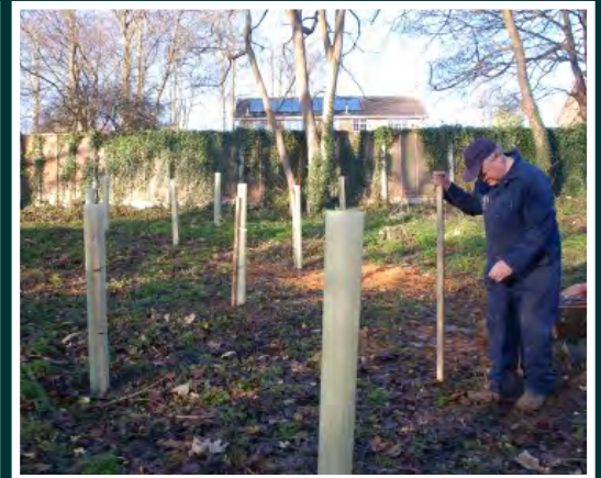
Tree planting using tree shelters

Conifers may be suitable as ornamental trees but you need to consider their impact on the landscape as they grow. Are there any conifers already growing nearby? If not, then it may be preferable to use species already found in the area. Most conifers do not like chalk soil but grow well on the more acid clay with flint soils of the Chilterns plateau.