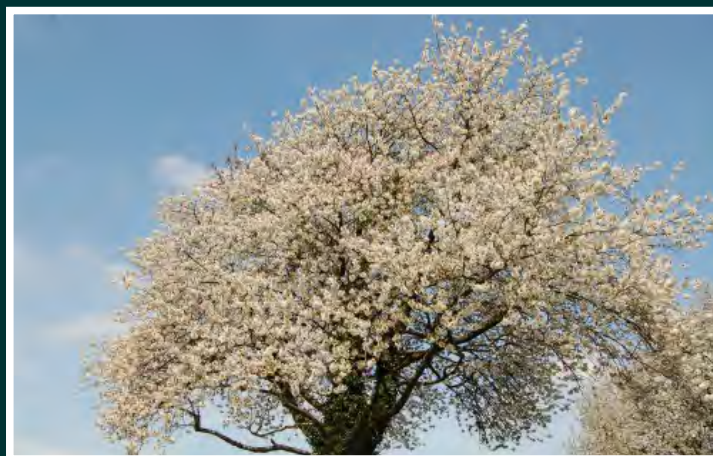
Cherry blossom - a feature of the Chilterns