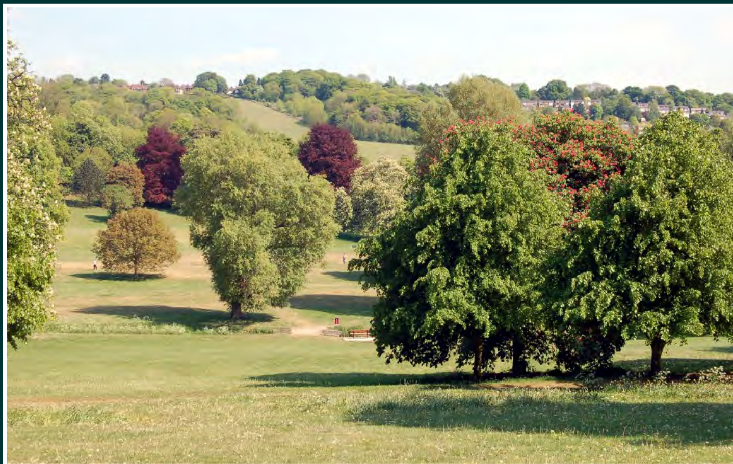
Parkland trees - Hughenden

The Chiltern Woodlands Project is keen to promote the planting of new landmark and feature trees in the Chilterns AONB to replace those lost to old age, storm damage and disease. These could either be as individual specimen trees or small groups and clumps.