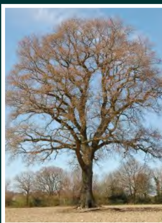
Open grown oak