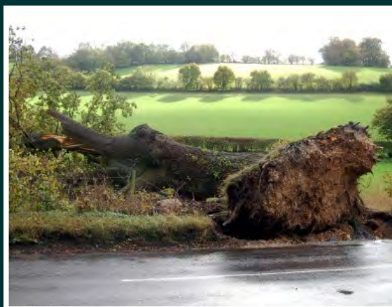
Storm damaged oak