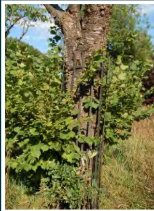
Cherry in old guard