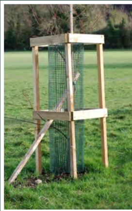
Tree planting and protection