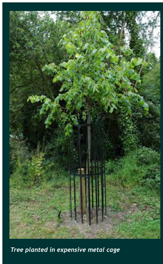
Tree planted in expensive metal cage

Tree planting is generally a winter activity when broadleaved trees are not in leaf. December is often the best month to plant bare rooted broadleaved trees as it gives them time to develop new roots before they leaf up in spring. However, any time before April is possible provided the trees are dormant, the ground is not flooded and is free from frost.