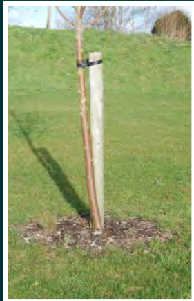
Stake and tie on standard tree