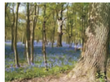
Bluebell wood - Steve Rodrick

Woodland covers over one fifth of the Chilterns AONB and is important for red kites which nest high in the tree tops. Many of the woods are ancient (pre 1600AD) but the well-known beech woods were planted more recently in the eighteenth century to provide timber for furniture makers. Nowadays they are mainly managed for nature conservation and recreation.