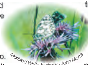
Marbled White butterfly

Chalk downland is the result of many years of grazing by livestock, such as sheep on the chalk hills. The grassland supports a wide diversity of plants and animals. Rare flowers such as the bee orchid and the Chilterns gentian can be found as well as the chalkhill blue and marbled white butterflies. Chalk downland is home to large populations of rabbits, which form a major part of the red kite's diet. In places scrub has invaded the grassland and this habitat is important for wildlife too. Many birds and insects find food and shelter