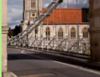
Marlow bridge and church

The Board can offer small amounts of funding to local voluntary and community groups and businesses, for projects which will enhance the Chilterns AONB and people's enjoyment of it. Visit our Funding page for more information.