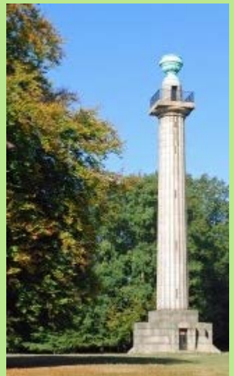
Bridgewater Monument Ashridge