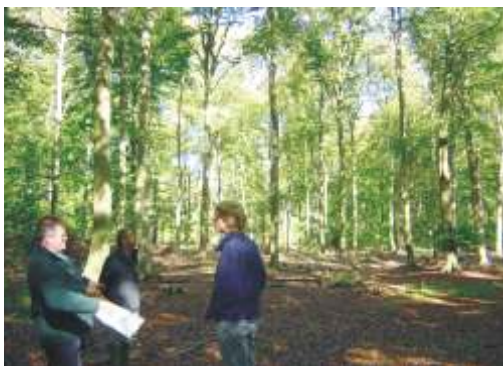
Visit to 2004 winning wood, Nippers Grove